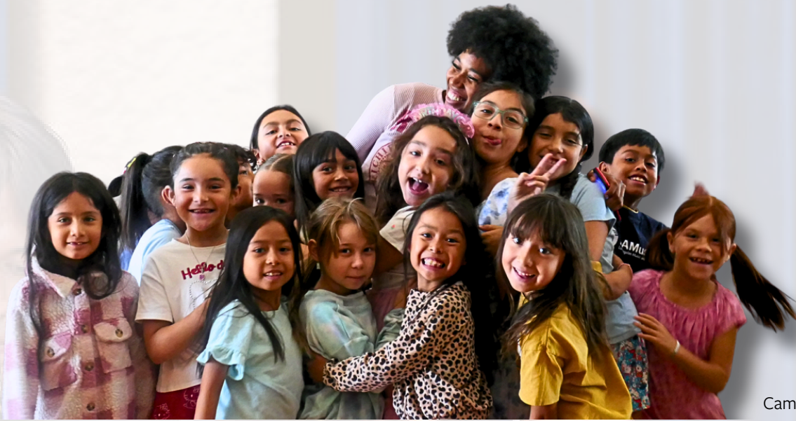
Camp MusArt Dance Class