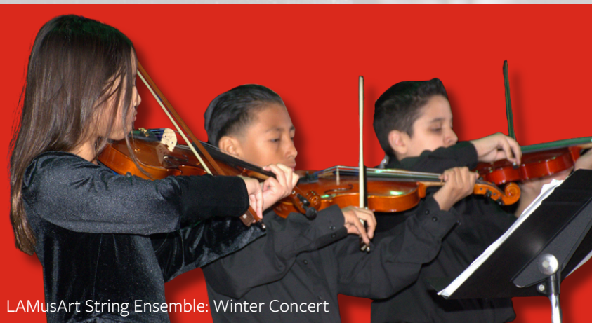
LAMusArt String Ensemble: Winter Concert