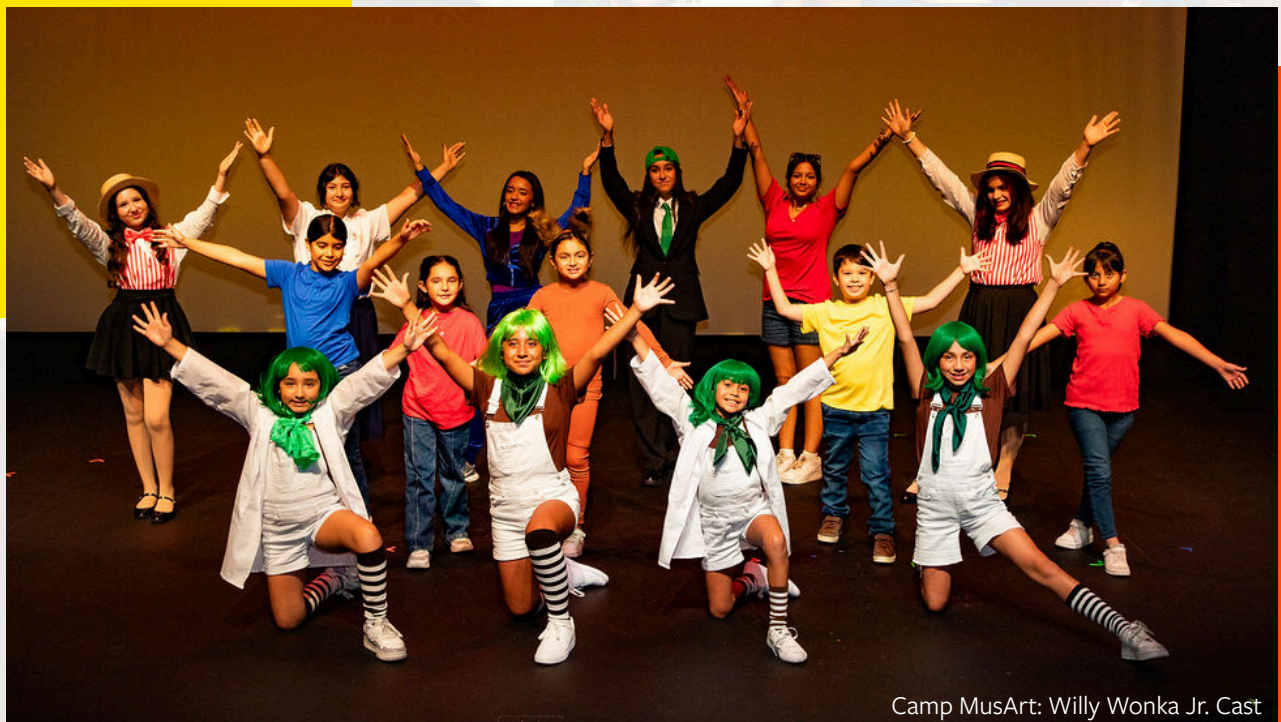
Camp MusArt: Willy Wonka Jr. Cast

We believe affordable and equitable arts education strengthens students and communities by expanding one's world outlook, sharpening one's creative skills, and contributing to one's social, behavioral, and academic development. We aim to diversify the creative landscape of LA by providing equitable opportunities for our youth community to experience success and safety through the arts.