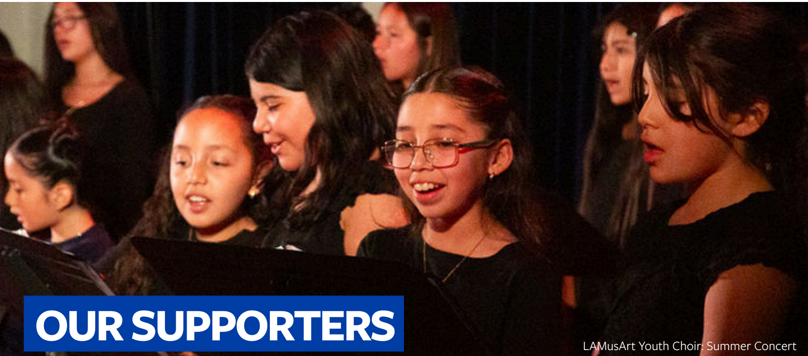
LAMusArt Youth Choir: Summer Concert