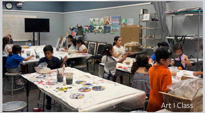
Art I Class

In celebration of its 80th year, LAMusArt launched The Art of Impact , a campaign to highlight and strengthen programs, expand access, and celebrate the power of art to transform lives.